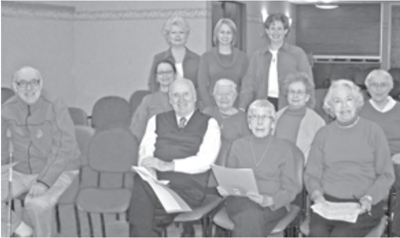
Members of the Milwaukee Catholic Home Choir

Milwaukee Catholic Home residents could often be heard singing beautiful Christmas music this holiday season. The MCH Choir, comprised of residents, staff members and friends, rehearsed diligently throughout the fall and winter in preparation for a performance on the Epiphany. The choir presented their selections for residents of the Health and Rehabilitation Center prior to their communion service and residents of The Residence following daily mass. The appreciative audiences enjoyed the varied program, which ranged from popular hymn, "Joy to the World," to African-American spiritual hymn, "Children Go Where I Send Thee." The performances were a great way to keep the holiday spirit alive and wrap up the festivities of the season!