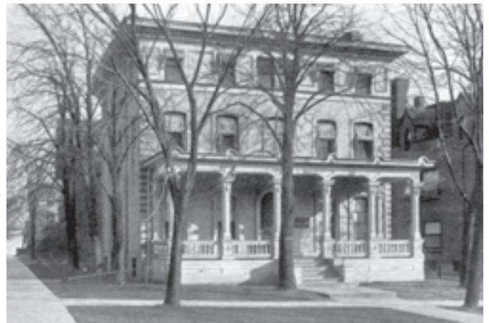
The original MCH building located at 544 Astor Street

In celebration of our 95th year, MCH will host several special events throughout the year, including our anniversary mass and luau celebration on Friday, July 11th. We hope you will join us in celebrating our past and maintaining our commitment to serving seniors in the future.