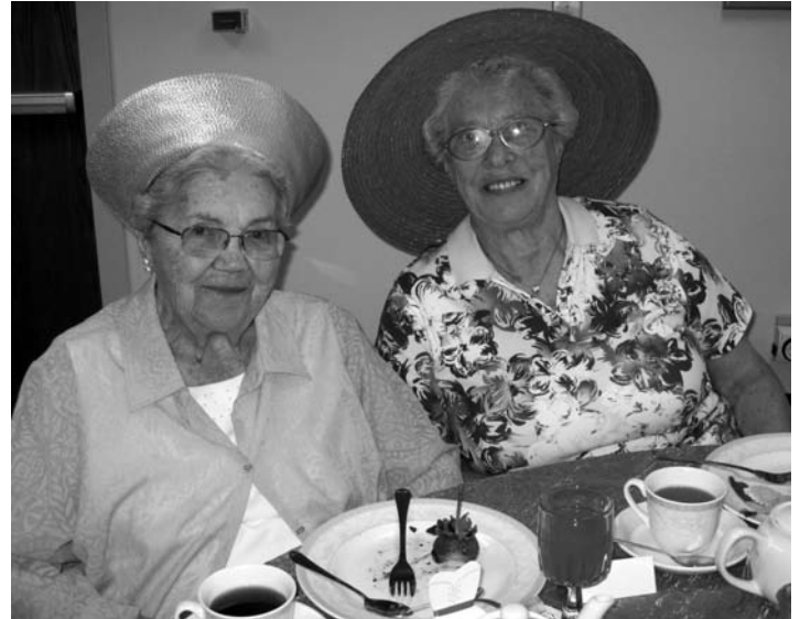
Residents in Assisted Living don hats fit for a royal wedding and enjoy an elegant Afternoon Tea.